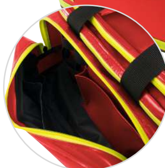
Elaborately divided front pocket