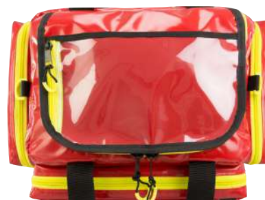
Lid for individual labelling